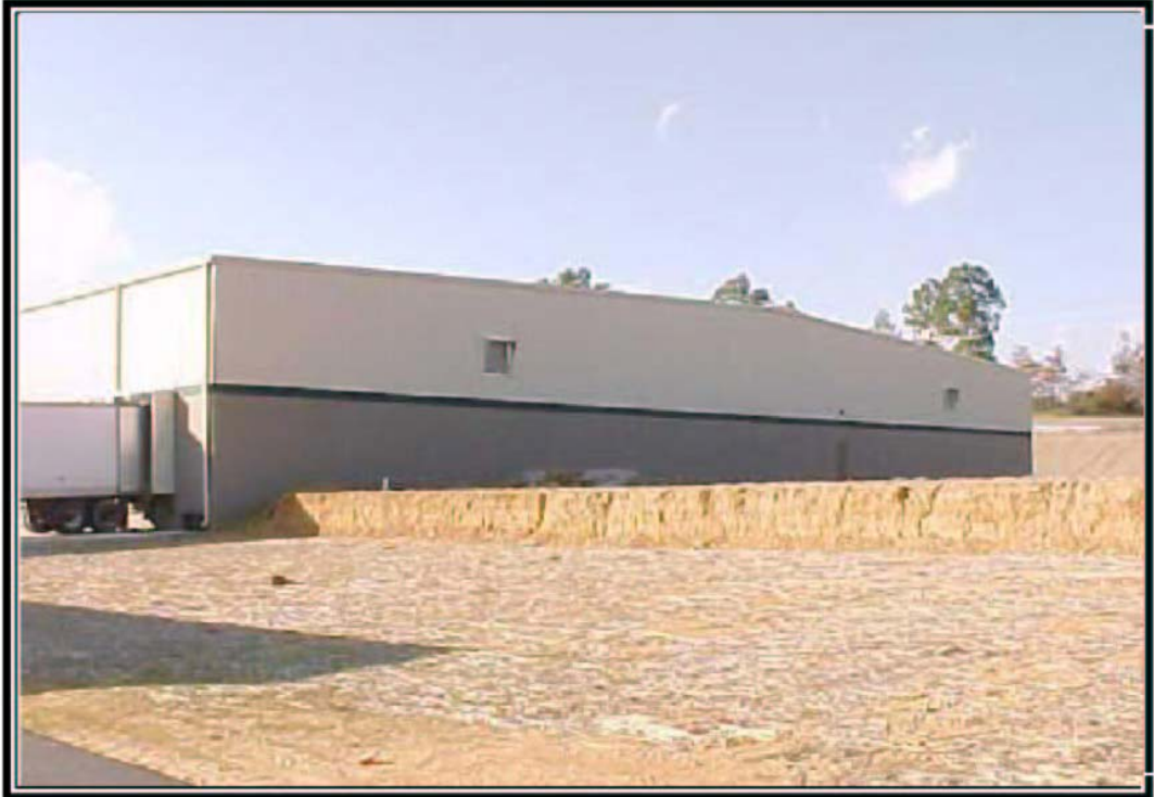
30 Sanker Road Dickson, TN